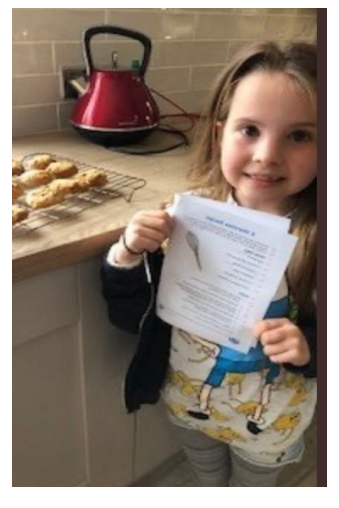
A recipe used during rationing, replicated brilliantly.