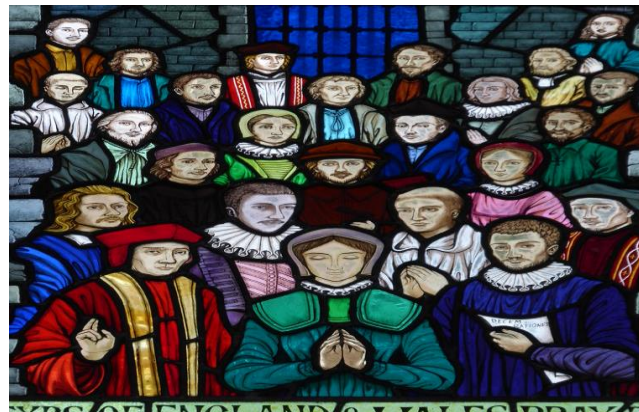
The English Martyrs

St. Thomas More, St. John Fisher, St. Nicholas Owen and St. John Wall