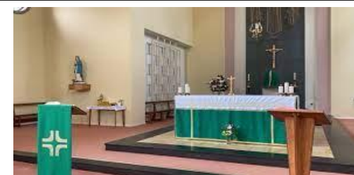
What can you see in the church?