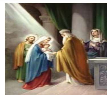
The presentation of Jesus in the temple