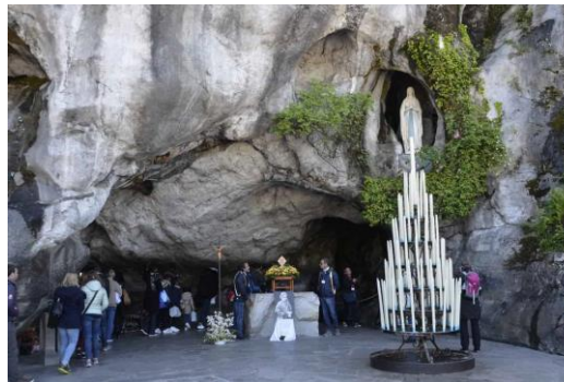
Lourdes in France