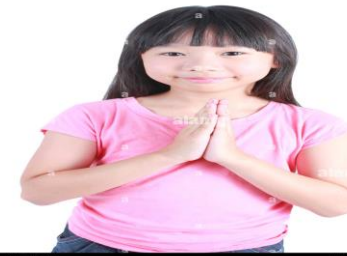
We put hands together to pray.

loving hopeful attentive faith-filled generous eloquent intentional truthful learned wise grateful discerning compassionate active