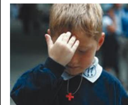
Making the sign of the cross