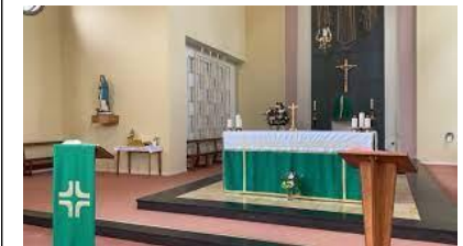
Inside St Mary of the Angels Church.