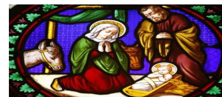
The Birth of Jesus