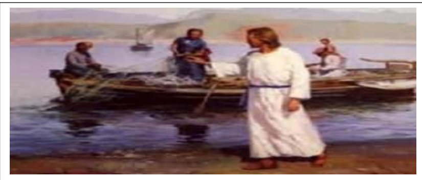
The Calling of the Disciples.