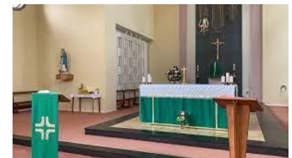
Inside St Mary of the Angels Church.