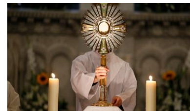
The Blessed Sacrament